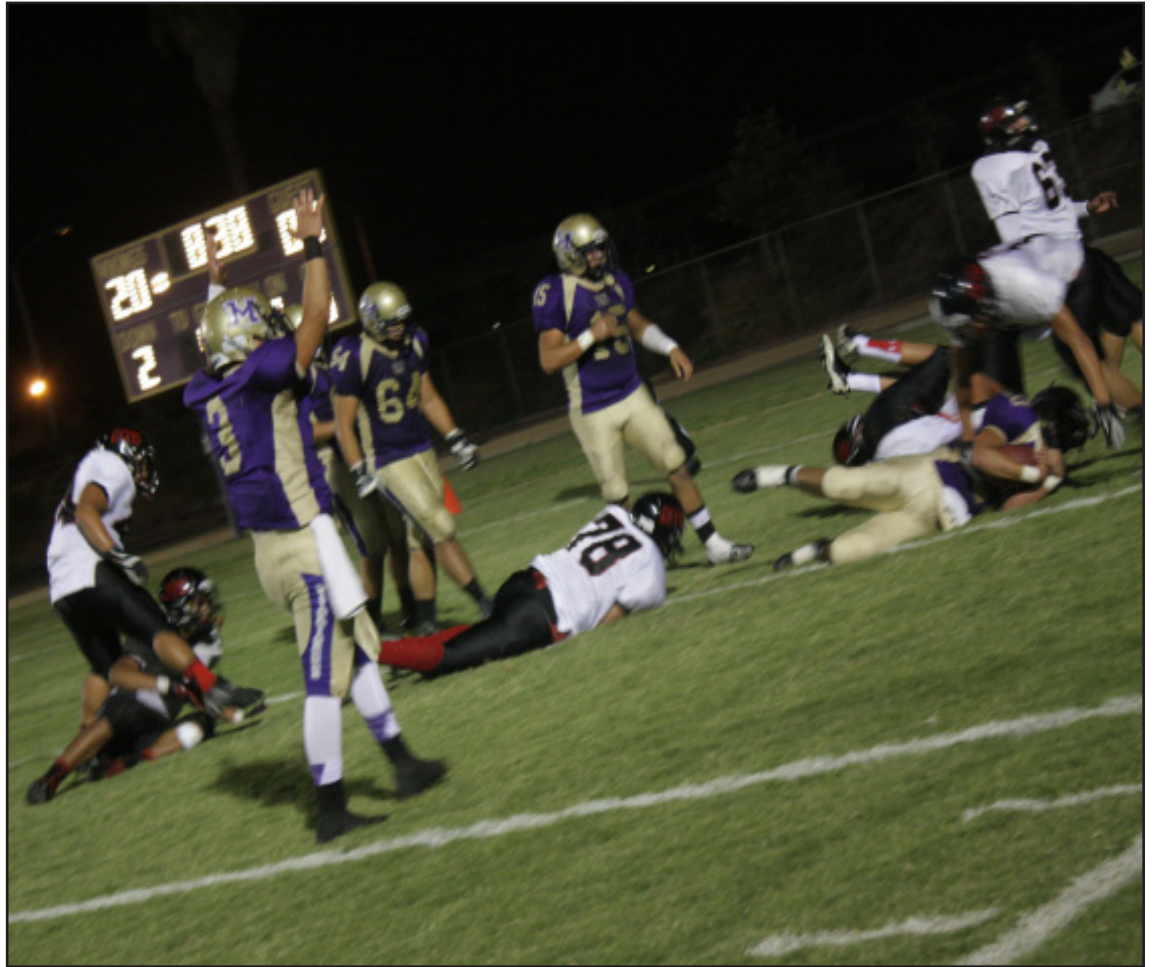
The Viking football team scores a touchdown during the third quarter against Sierra Vista.